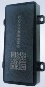
4G GPS Module Built-in