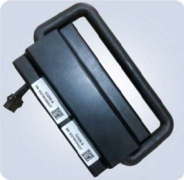
4G GPS Module Portable