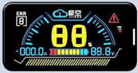
With Active Switch Size:60*35*10mm