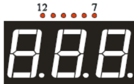
数码管显示及引脚位置图 6 NO PIN